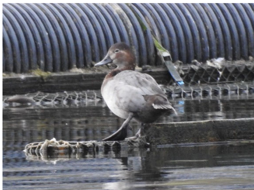
Top: Jay ( Garrulus glandarius), 21st. Bottom: Female Pochard ( Aythya ferina), 24th.

Birds: A total of 52 different bird species was recorded on and around Kinghorn Loch during December, a very reasonable total given that most recording was done in the second half.