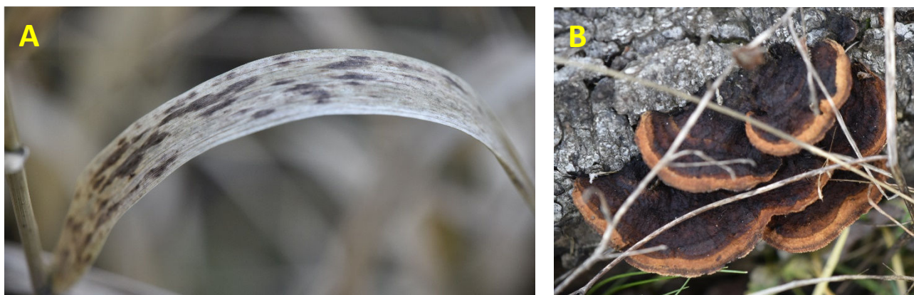
Fungal records, Kinghorn Loch, December 2024. A , Mycosphaerella recutita on Reed Sweet-grass, 10th, new Loch record. B , Conifer Mazegill ( Gloeophyllum sepiarium ), 10th.

Just two different fungi and allies were identified around the Loch during December. One was the often-seen small brown bracket fungus, Conifer Mazegill ( Gloeophyllum sepiarium ). The other was forming black streaks on dead leaves of Reed Sweet-grass ( Glyceria maxima ) at the marsh, where I found it on 10th; I have tentatively identified this as Mycosphaerella recutita , December’s only new Loch record other than the Little Egret. Four lichens (plus some others that are as yet unidentified), four mosses and two terrestrial algae were also found, the most notable being Common Pocket-moss ( Fissidens taxifolius ) near the marsh on 10th.