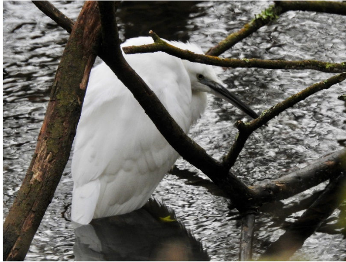
Little Egret ( Egretta garzetta ), 26 December 2024. New Loch record.